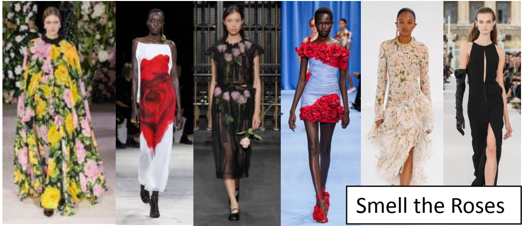
Smell the Roses