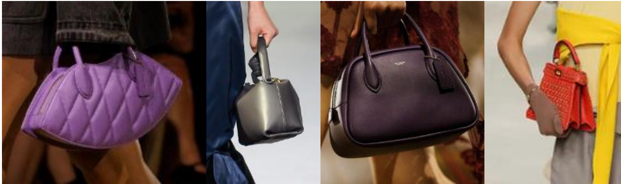
Top Handle Bags